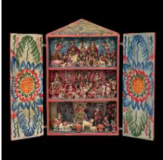
Retablo from Ayacucho, circa 1950, wood, paste, starch flour, gypsum, painted, loan from Paul Laternser

Peruvian nativity scenes in a wooden box are called 'retablo'. They date back to Spanish missionary activity in Latin America in the 16th century.