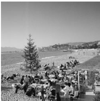
Christmas photograph from France

Christmas tree on the beach at Cannes, 1976.