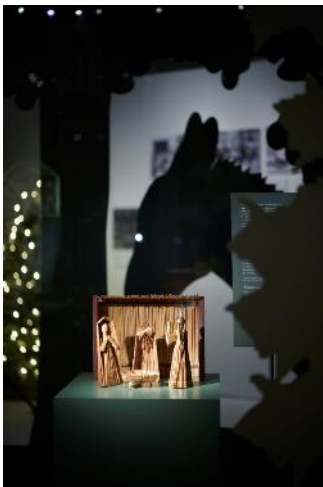
A view of the exhibition.