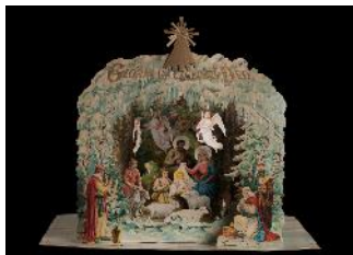
Fold-up nativity scene from Constance, circa 1910, cardboard, sheet metal, gelatine foil, loan from Alfred Dünnenberger

With the development of graphic printing in the 19th century, nativity scenes printed on card began to appear in private households. Because they were easy to assemble and disassemble, they were also known as 'Faulenzer-Krippen' (lazy man's nativity sets).