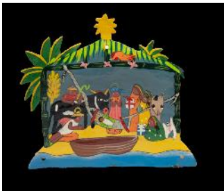
Sheet metal nativity scene from Haiti, 2015, oil drum metal sheet, painted, loan from Brigitta Burkhard

In this Haitian nativity scene, the Adoration of the Christ Child in the stable is taking place at the water's edge. The Christ Child is lying in a hammock and the figures are wearing Caribbean clothing and headwear.