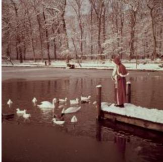
Christmas photograph from Switzerland

Father Christmas feeding birds beside a park pond, 1958.