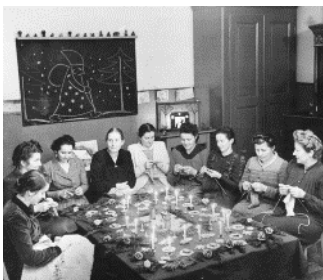
Christmas photograph from Switzerland