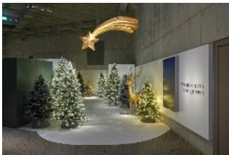
A view of the exhibition.