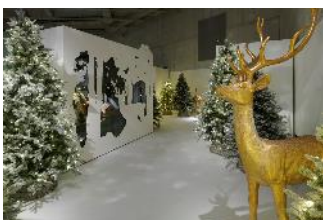
A view of the exhibition.